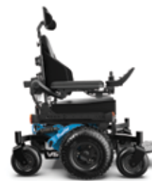
BLAZE BLUE BASE BLACK AT TYRES & RIMS