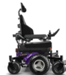
ULTRA VIOLET BASE BLACK CROSSOVER TYRES