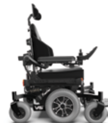
OYNX BLACK BASE GREY URBAN TYRES